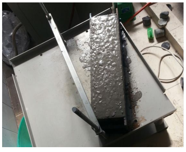
Figure 4. Specimen prepared for test.