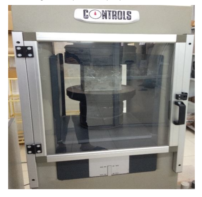
Figure 5. Testing of concrete cube in Advantest 9 (control- Italy) system of HUMG.