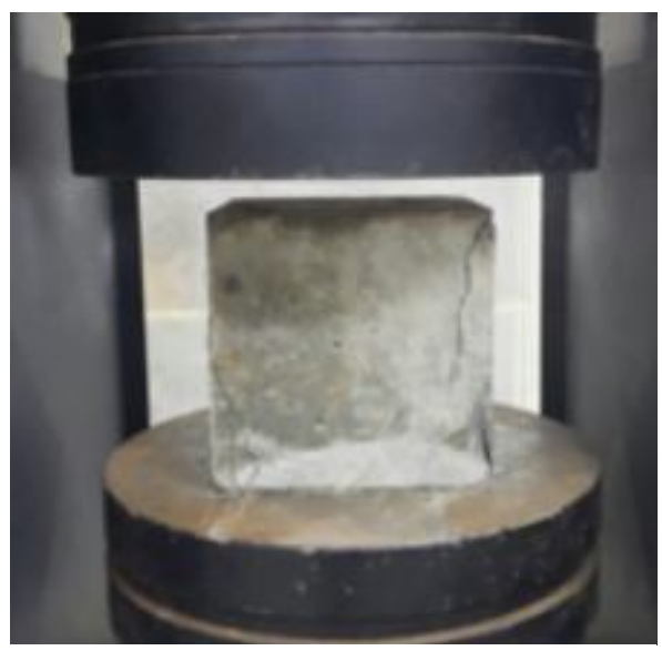
Figure 6. Compressive strength test at HUMG.