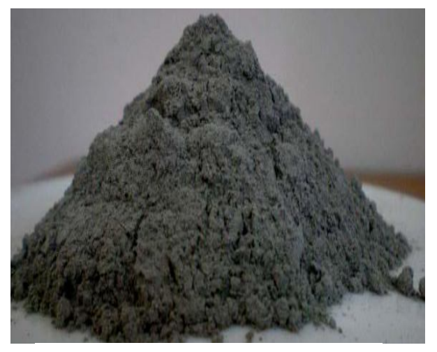
Figure 1. Sample of fly ash.