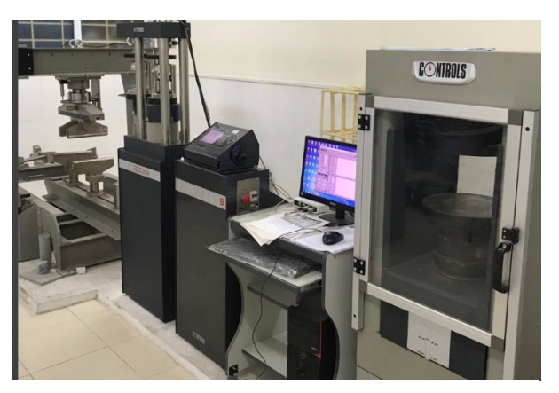
Figure 3. Advantest 9 (control- Italy) system of HUMG.

Cement: Ordinary Portland cement (Ambuja Cements of 53 grades) was used having specific